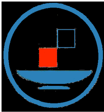
The chalice symbol of the Unitarian Universalists of Croatia

Worldwide UU Emblems , First Unitarian Congregation of Ottawa, Canada. Retrieved February 2005 from http://www.uuottawa.com/world%20emblems.htm